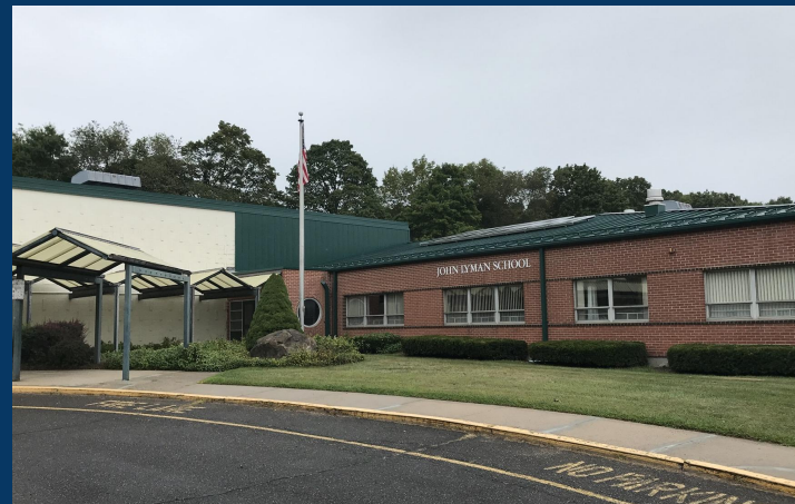
John Lyman School 140 Way Road, Middlefield (860) 349-7240 lyman.rsd13ct.org