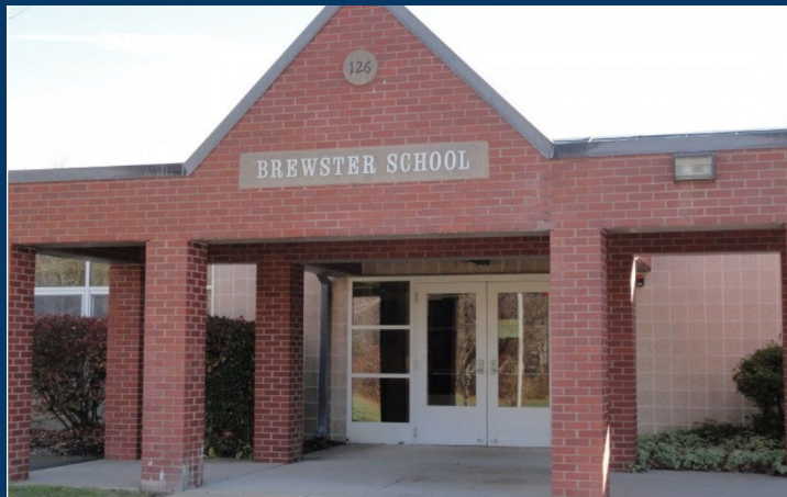
Brewster School 126 Tuttle Road, Durham (860) 349-7227 brewster.rsd13ct.org